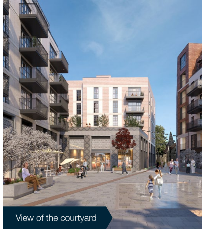
View of the courtyard