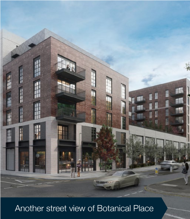
Another street view of Botanical Place